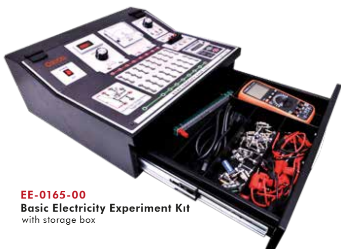
EE-0165-00 Basic Electricity Experiment Kit with storage box