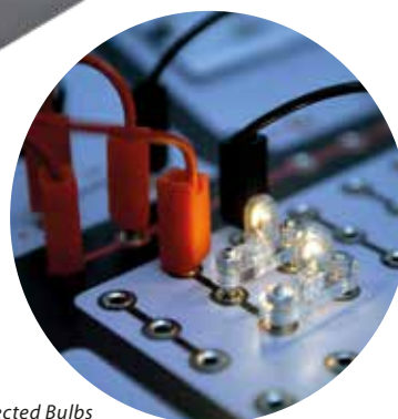
Parallel Connected Bulbs